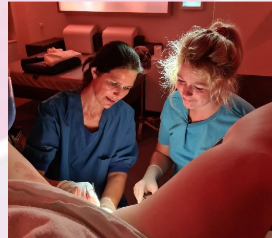
Optimised Hegenberger procedure