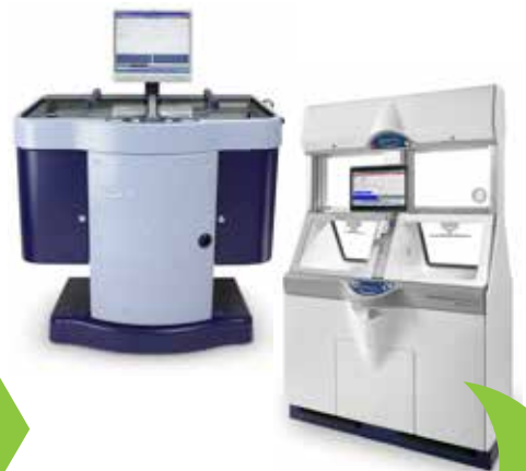
FIT SECURELY IN ADVANTAGE REPROCESSOR